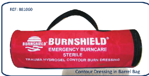
Contour Dressing in Barrel Bag

The Cotton based Contour burn dressing was developed as an extension to the professional range as a half body and full body dressing which makes this unique for the hospital and pre-hospital environment and is cost-effective.