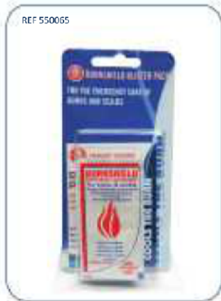
Burn Blott Sachets (5's)

Available in pre-packed Blister packs with Euro slot.