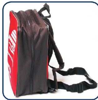
Confined Rescue Kit