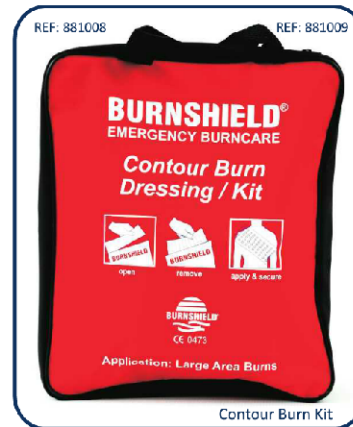
Contour Burn Kit