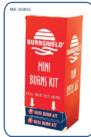
Wall Mount Dispenser