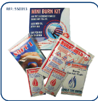
Mini Burn Kit - Single

This Kit is compact and lightweight For minor burns and scalds.