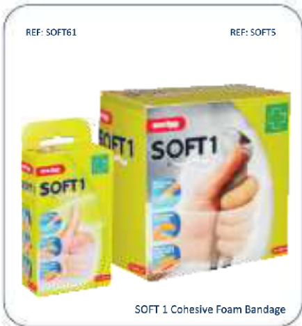
SOFT 1 Cohesive Foam Bandage

DIMENSIONS: (60mm x 1m) 70mm x 30mm x 115mm