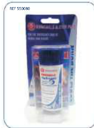
50ml Bottle + Soft 1

CONTENTS: 1 x BURNSHIELD HYDROGEL SPRAY 75ml 2 x BURNSHIELD BURN BLOTT SACHETS 3.5ml 1 x SOFT 1 COHESIVE BANDAGE