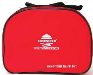
Essential Burn Kit