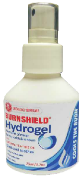
75ml Spray Bottle