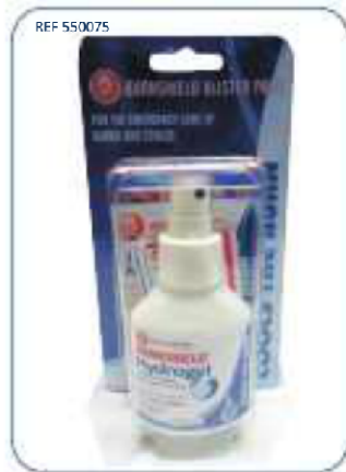
75ml Spray Bottle + Soft 1 + Burn Blott Sachets (2's)

CONTENTS: 5 x BURNSHIELD BURN BLOTT SACHETS 3.5ml